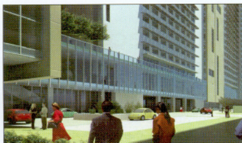
GreenSpaces entry drop-off in the east

Bureau of Energy Efficiency (BEE). This is a prime-ministerial initiative. Now it is only recommendatory. But by next year we are trying to make it mandatory. Every building should comply with the ECBC. This becomes the pre-requisite. The green building concept starts from there. But if the energy consumption is meeting ECBC and above, may be 10 percent, 20 percent or 30 percent more efficient, then we give green ratings for the buildings. It is expected that the ECBC will be mandatory by 2009 and going green in next three to four years.