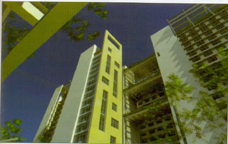
Tower perspective: GreenSpaces

Every builder needs to follow the ECBC, which came into existence in July 2007, implied by the